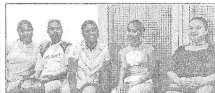
Graduates of the School of Arts & Sciences, School of Business, and School of Technical Education.