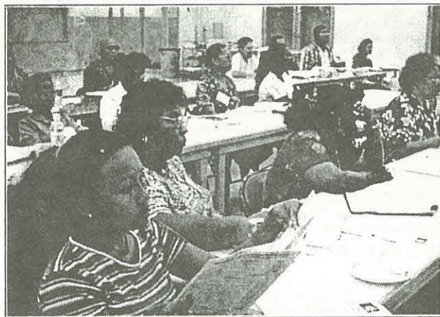
Upward Bound Staff during yesterday's (Thursday) Session.