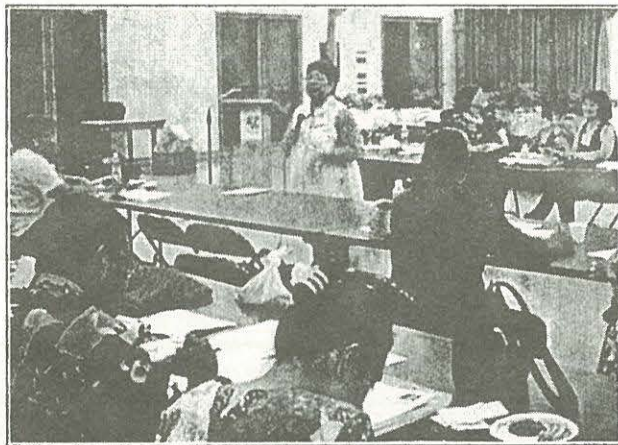
All sessions were held in the PCC Cafeteria except for today's session which will be at the rock islands.