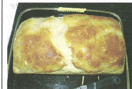
Tapioca cookies and taro bread, some of the food products made by PCC-CRE.

The Palau community College-Cooperative Research and Extension (PCC-CRE) is the research arm of the College. Results of researches conducted under