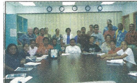
Upward Bound summer students during their visit to the Belau National Hospital.

It's that time of the year where Upward Bound students begin a six-week summer program at PCC campus. Upward Bound students, part-time teachers and other summer staff gathered yesterday, May 29, at PCC