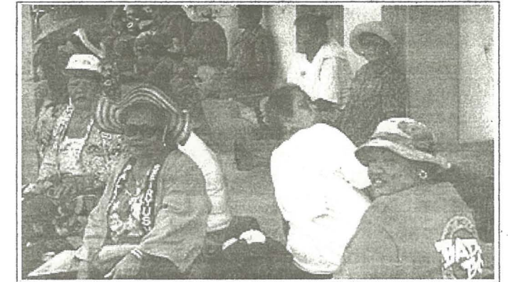
Ngarchelong and Ekei Women's Club Visits Ngermeskang projects and hatchery.

In the next few weeks the R&D Station will be visited by three more groups, a group of 8th graders from Yap, the Kabekel Women's Group, and the Ngarchelong Women's Group from Koror. If you or your group is interested in touring the R&D Station, please contact the CRE office at 488-2746.