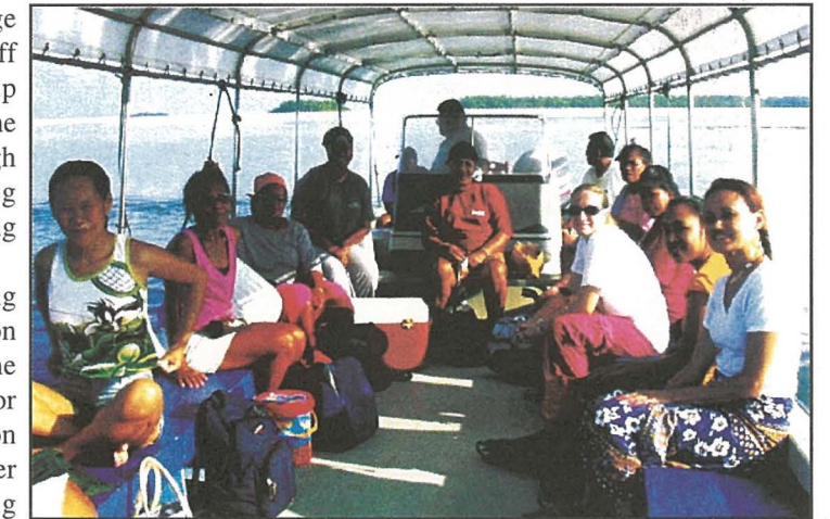
PCC CE staff on their boat ride to Carp Island Resort for their development training.

A great deal of material was covered in the training sessions, and each session allowed opportunities for interaction and group work among the attendants. The sessions offered some new information and served as a refresher for proven methods for providing good customer service, understanding communication techniques, and creating effective goal plans. In the Customer Service session the group discussed methods of providing excellent customer service and the relation of customer service to the College mission and values. In the Communication session, CE staff members learned ways to improve developed skills to improve their goal planning and goal evaluation strategies to achieve better outcomes in both personal and professional goals. The training day reached a rare balance between hard work and relaxation by combining challenging skills workshops with a beautiful and stress-free setting. The atmosphere was constructive, positive, and fun. The trip provided CE staff a chance to interact as a group, rather than individual offices. After working through the training sessions, the participants enjoyed a short time on the beach and visiting the Yapese stone money before returning to Koror.