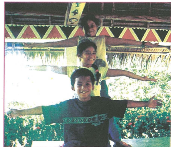
Happy kids from PCC's Kids Summer Program pose for the Mesekiu News.