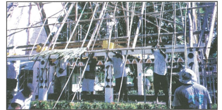
Ngara Mecherocher (Young Men's Group) Working Hard

This past Saturday and Sunday, the Young Men's Club from Melekeok, Ngara Mecherocher replaced the thatched roofing of the Bai Ra Lebuu. This arduous task takes many long hours as the process begins with the leaves of the Palm tree (Toechel) being striped and sewn onto segments of bamboo strips that vary in length. These segments are then further sewn onto the rooftops in sections and reinforced with thin bamboo reeds, (Lild).