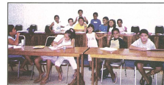
CE Students Pose for a Photo

Beginning earlier this month the much anticipated one-month long PCC Summer Kids Program officially began. The PCC's CE Office offered courses for interested students from the 3rd grade thru the 6th grades. This summer 2004, courses are offered in the following subject areas: English Writing and Mathematics.