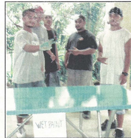
PCC Construction Tech. students resurface and paint benches at the Btaches classroom building.

Educators from schools all across the Pacific, Hawaii and the US mainland are expected to attend this year's PEC conference.