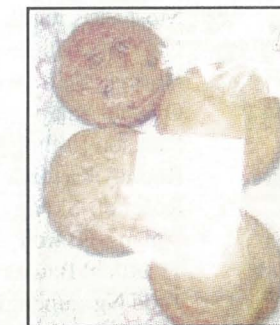
Taro muffin, one of the many food products made with taro.

Taro is nutritionally beneficial. Not only that it is a good source of carbohydrates for energy, but also it contains several micronutrients like potassium. Potassium is the major cation in the intracellular fluid. It influences fluid electrolyte balance and acid-base balance, and plays a significant role in the activity of the skeletal and cardiac muscles. It also contributes to the transmission of nerve impulses and to the maintenance of normal blood pressure. Recent findings show that taro contains the female hormone estrogen, so this also adds to its many beneficial effects.