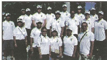
Canoe Team- Several PCC students and staff are starting paddlers on the canoe team.