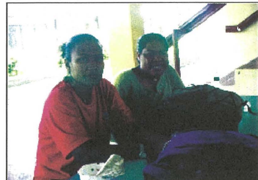
Peleliu State teachers having a lunch break after morning class.