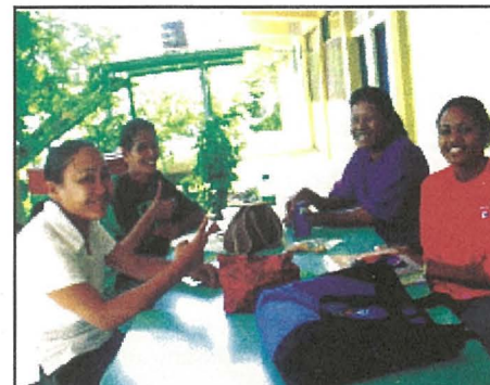
PCC students taking a short-break from their classes.