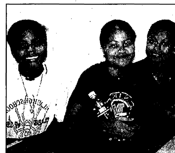
New students during the orientation in the PCC Cafeteria.

For more information, contact PCC-CRE at phone #488-3307 or E-mail: ASuta @palaunet.com