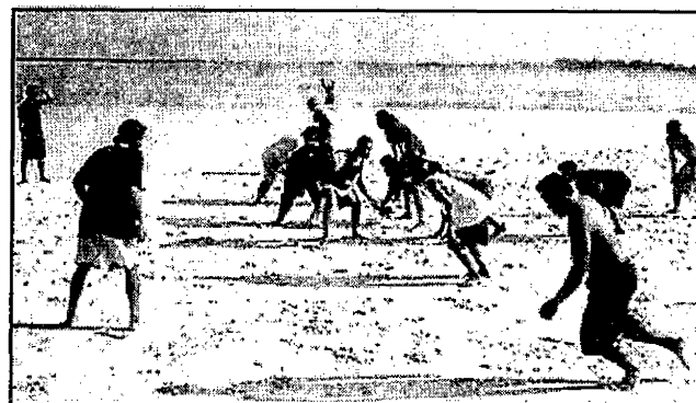
PCC students enjoying a game of football during their trip to Ngchus.

Mesekiu's News Palau Community College P.O. Box 9 Koror, Palau 96940