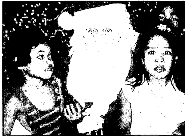
This picture was taken last Christmas at Bethlehem park by the OEK. To claim this photo, please stop by the PCC Development Office or contact Armstrong at 488-2471, ext. 253.