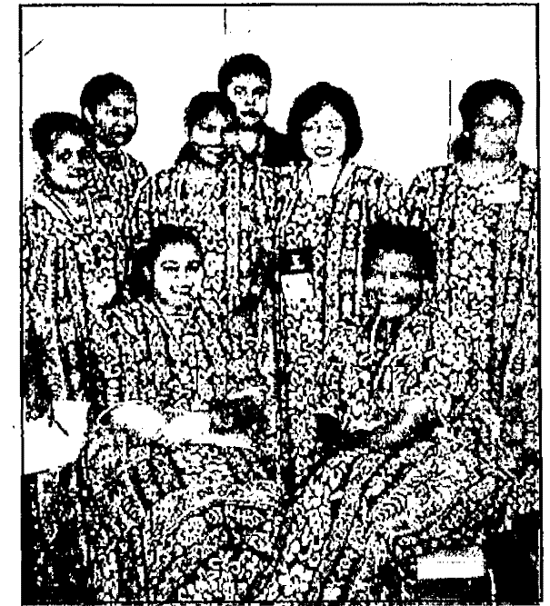
PCC Admissions & Financial Aid Staff