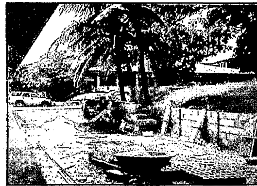
New retaining wall for the new classroom building will provide stability to the new building as well as expand the grounds around it.