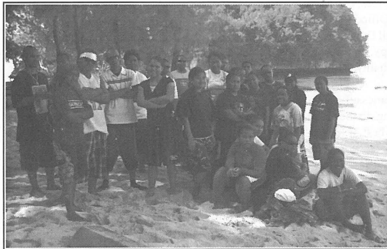
Upward Bound Math & Science (UBMS) students during their rock island field trip last week at Ngkesill island.