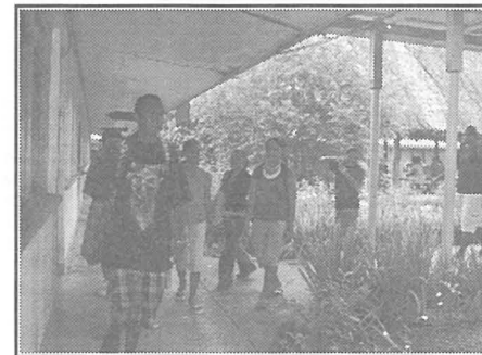
Students enrolled in the various summer classes offered at PCC.

Even though it's summer break, Palau Community College (PCC) is still accommodating students and offering summer courses for all eighteen programs. Over two hundred students have taken advantage and enrolled for classes this summer. Out of all the programs offered, the Education program holds the most number of students with fifty-eight (58). This may be due to the fact that the teachers from all over Palau are taking advantage of the summer break and