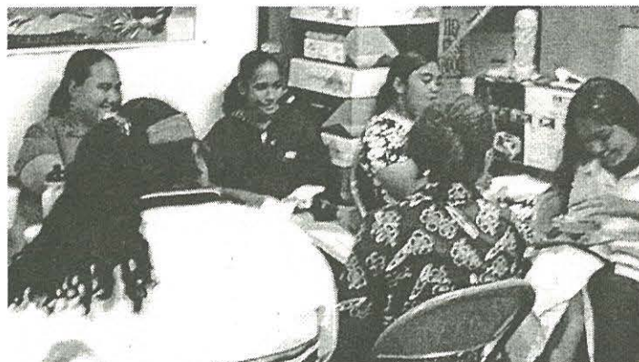
Students working attentively on their class projects.