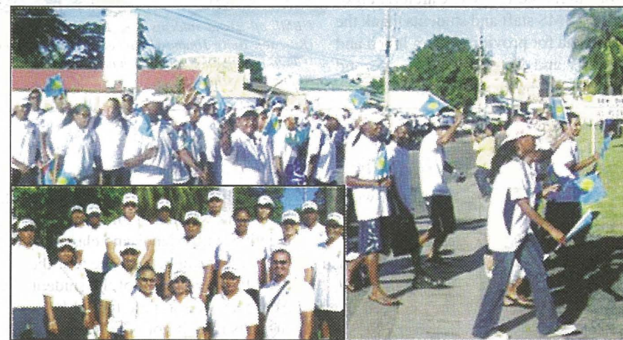
Team Palau members proudly displaying the national colors as they pass in front of the OEK building during their sending-off parade last Thursday. (inset) Medal favorite, outrigger canoe team.

The mass exodus of the 250-strong Team Palau delegation to the 2006 Micronesian Game in the Commonwealth of the Northern Marianas (CNMI) started last weekend with the departure of the men and women's volleyball team including a number of volunteer officials. Because of the size of the delegation, a single charter flight was not enough to transport everyone so other members of the delegation had to be booked on regular Continental flights.