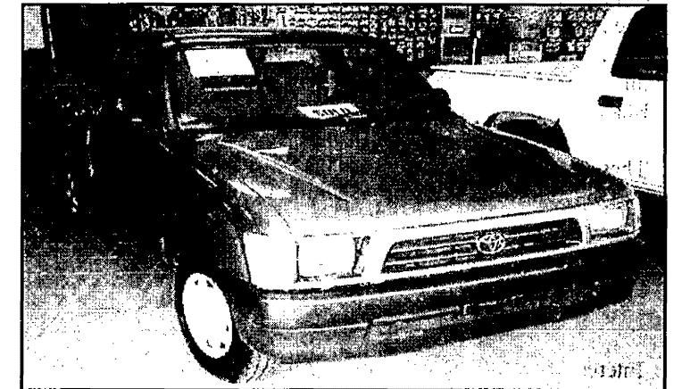
Grand Prize - Brand New Toyota Pick-Up Truck soon to be on display at PCC. Look for it!!!