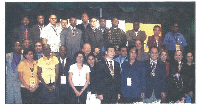
Taiwan ICDF conference participants.