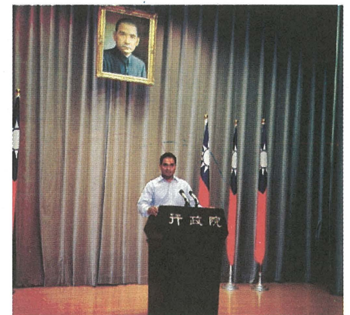
Debelbot's presentation included the overview of Palau and the special relationship between Palau Community College, the government and the local media industry.

Also in his presentation, Debelbot talked about how Palau resembles Taiwan's democratic government system, a government that puts great emphasis on the freedom of the press, thus helping the media industry flourish without censorship and constraint, compared to the media industries from the other participating countries. He also talked about the mutually beneficial interdependency between the Palau government and the media industry (print media), with the government relying on the media to disseminate information to the public and the media looking to the government as a main source of news. Debelbot concluded his presentation by talking about how Palau Community College, as a non-profit organization, (continued on Page 3)