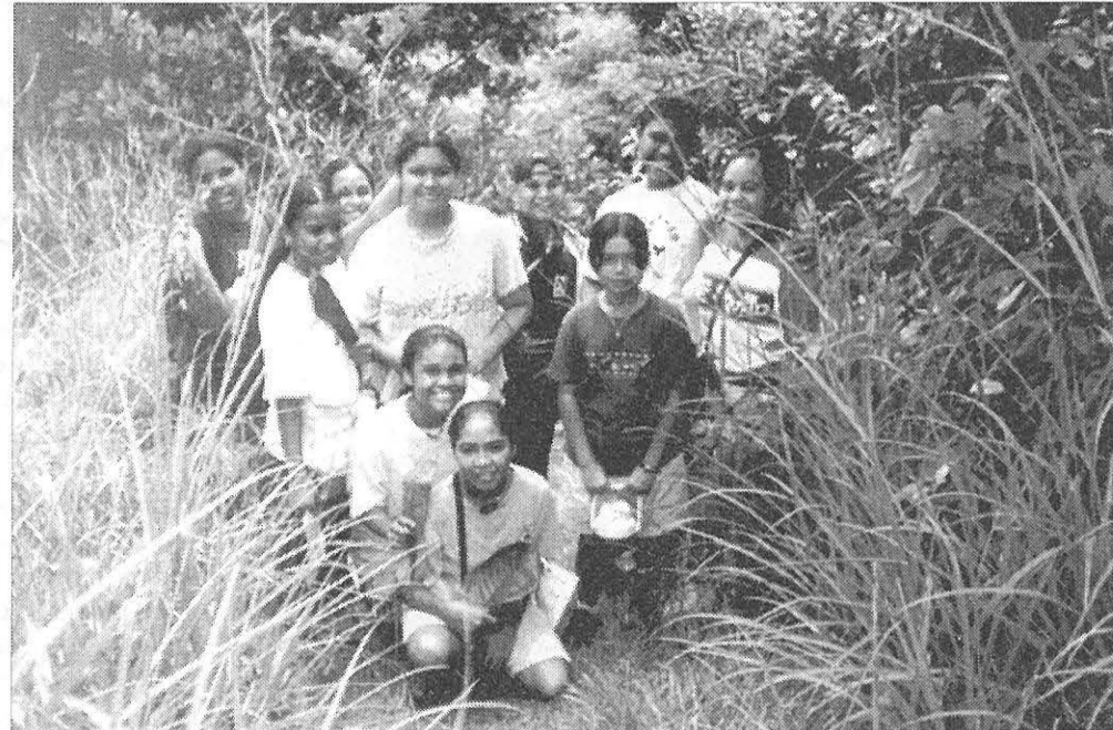
Students during their hike through the Palau Pacific Resort Nature Trail.

Summer Wildlife Experiences as Described by the Participants: