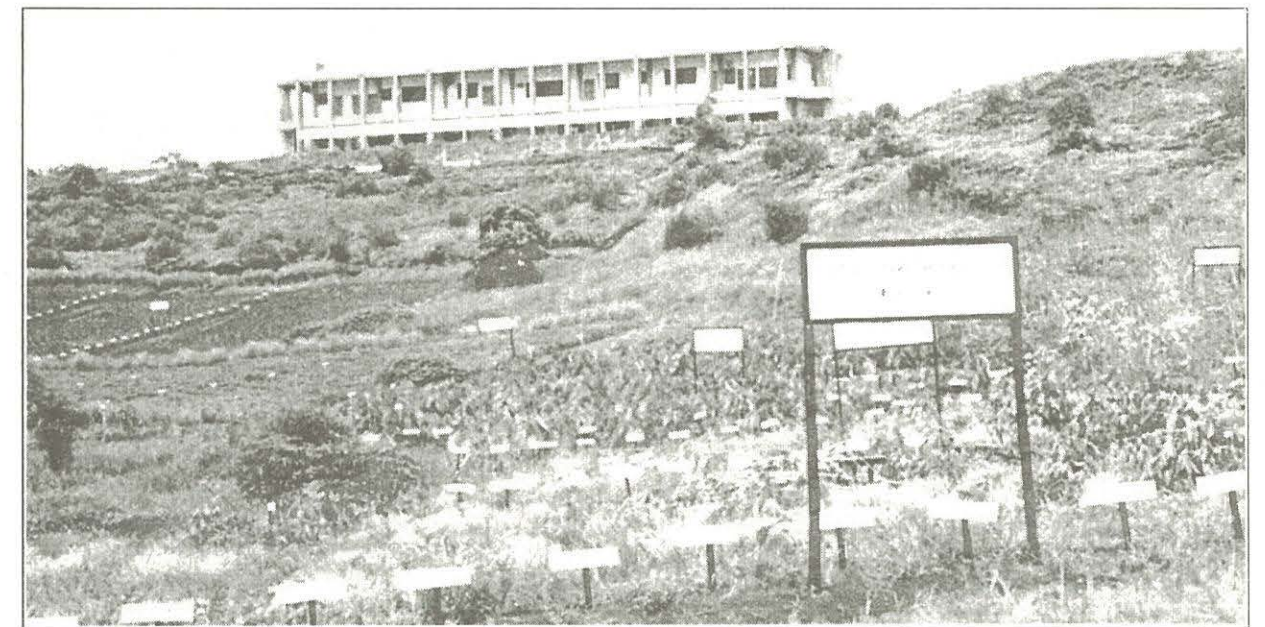
The Palau Community College - Cooperative Research & Extension's R&D Facility sits on top of a hill overlooking a 25 acre-spread of farmland in Ngarmeskang, Ngaremlengui.