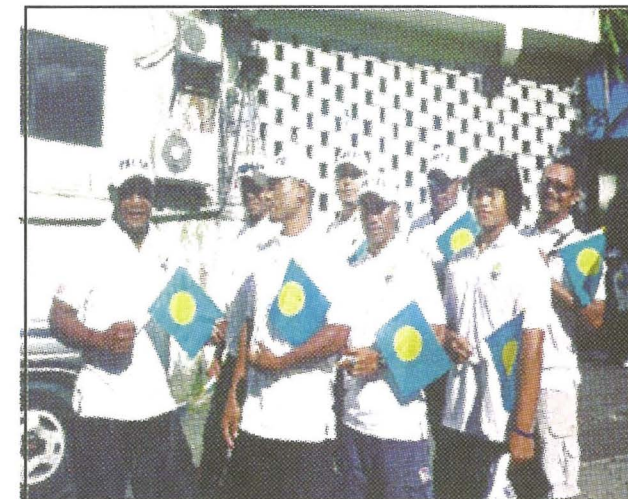
Men canoe team proudly displaying their Palau flag.

As of Thursday June 29th, Team Palau places third based on the total of gold medals won. Overall, they have won 17 gold, 14 silver and 16 bronze which gives them a total of 47 medals. CNMI leads overall medal tally with a combined total of 81 medals, comprised of 26 gold, 29 silver and 26 bronze medals. Guam, on the other hand, has 40 gold, 24 silver and 15 bronze for a total of 79 medals. These three nations make up the top three medal winners