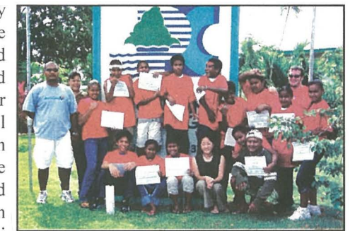
CRE Young Environmentalists are All Smiles

Palau Community College-Cooperative Research and Extension conducted a two-week Summer Environmental Education class in Ngaremlengui June 8 th -18. Thirteen 7 th and 8 th graders from Ngaremlengui