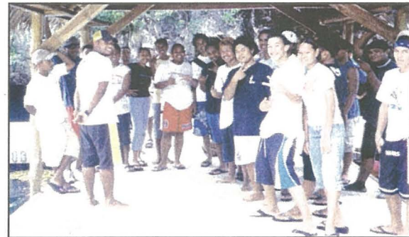
Photo of UBMS Students at Dolphins Pacific