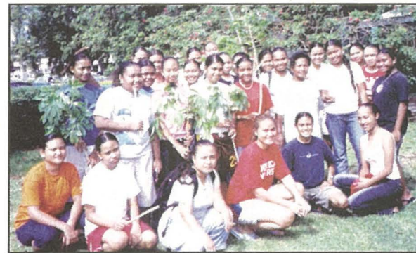
Photos of Upward Bound Students During Cultural Awareness Event