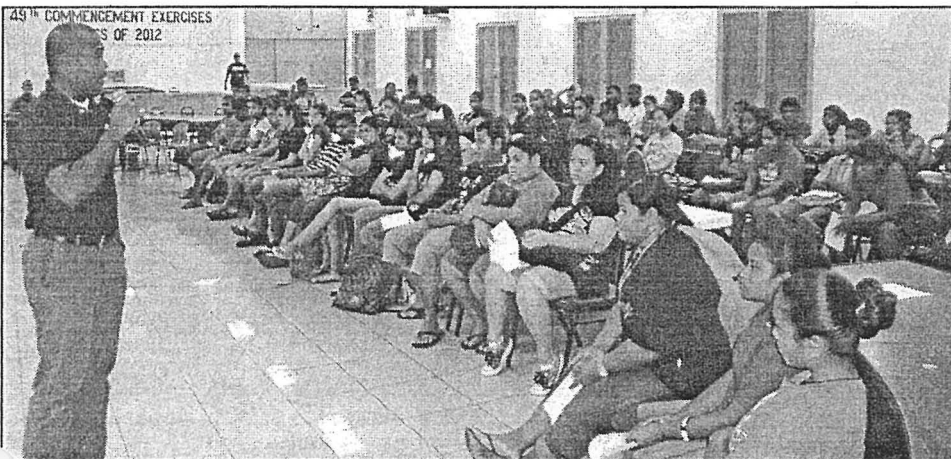
Students attending the Information Workshop.

On June 21, 2012, Upward Bound (UB) by Bureau of Public Safety's Division of students attended a workshop presented