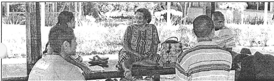
Dirrengchel observes as students practice "Chesols".