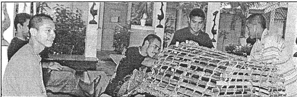
Students in a group project to build a "Bub".

The program ends on July 20, 2012 when the participants will have the opportunity to showcase their newly acquired skills.