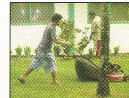
WIA, SWEP, and Upward Bound student workers are being tapped to help with the campus beautification effort ahead of the 2006 PEC Conference.

"It is a lot of manual work and we are very lucky to have secured student workers from the Workforce Investment Act (WIA), Summer Work Experience Program (SWEP), and Upward Bound programs. With the additional hands, I am happy to say that everything is progressing as scheduled and we will have everything in place and on time for the opening of the conference," Kazuma said, praising the student workers.