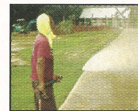
Worker keeps cool with towel on head while water blasting clean the sidewalks.

Much of the preparation is also to get the campus ready to host the 2006 Pacific Educational Conference (PEC) which commences next week. Albeit the week-long conference is hosted the Ministry of Education (MOE) and co-hosted by Pacific Resources on Education and Learning (PREL) and PCC, the college campus will serve as the main site for the conference, thus the pressing need for the facility upkeep.