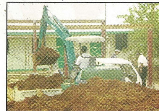
Foundation work on the new PCC library. In the background is the newly-constructed drafting and auto CAD class.

Taking advantage of the thinner than normal student traffic during the summer session, the PCC Maintenance crew have in recent weeks been busy logging in extra hours and even at times, working straight through weekends in carrying out essential maintenance and upkeep work on campus fixtures and facilities in time for the busiest semester- fall semester.