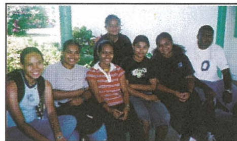
Upward Bound Students take a break between classes.