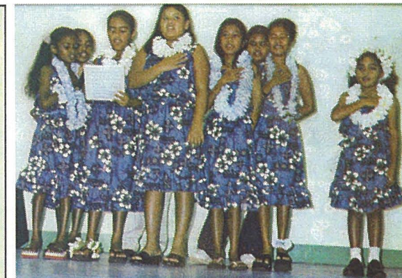
Music Class students sing Belau Er Kid (Palau National Anthem) at their graduation ceremony last Friday July 4, 2003.

1995 - 72 students served 1996 - 135 students served 1997 - 89 students served 1998 - 54 students served 1999 - 70 students served 2000 - 151 students served 2001 - 130 students served 2002 - 136 students served 2003 - 115 students served