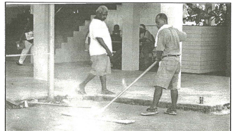
Batches parking lot under construction

For the past several weeks, PCC's parking lots' have been under construction to improve parking space. The paving of these parking lots also helps to keep soil erosion at a minimum as well as to prevent water puddles from forming. These projects are also part of PCC's overall beautification process that will also ultimately increase parking capacity. The College thanks everyone for their patience during this slight inconvenience; further, those who have been carpooling are commended for their efforts to minimize parking woes.