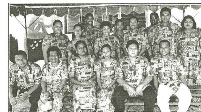
Main stage with all the special platform guests.