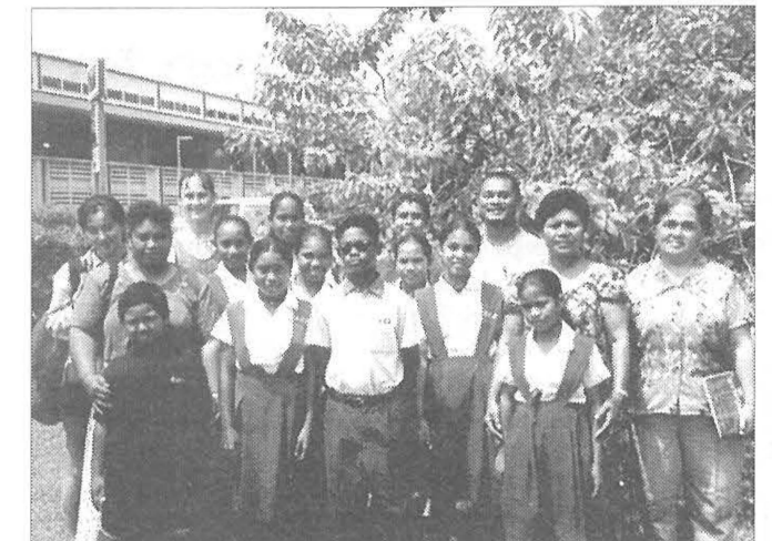
Aimeliik students and their teachers enjoyed their field trip to the PCC campus and expressed interest in a similar trip next Summer.