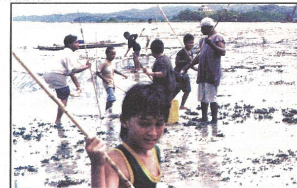
These Summer Camp students excitedly spear fish after having successfully trapped them using fishing nets.

Even though this is the first time PCC holds this summer camp, the College will be ready to offer it next summer should there be a request for such. Hence, anyone who is interested in this PCC program may contact Ms. Eileen Babauta at PCC telephone number (680) 488-2470/2471.