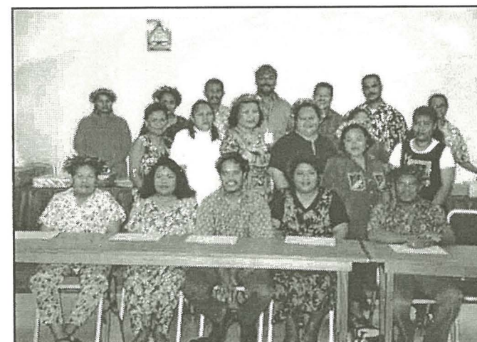
Thirteen G.B. Harris parents complete computer class and receive certificates of completion