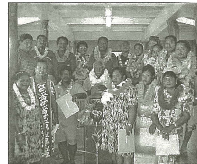
Seventeen Parents from Ngaremlengui State