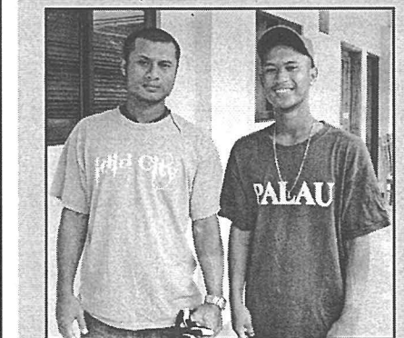
Eight students in the Talent Search program are confirmed members of Team Palau to