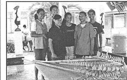
Students show rakes they’ve made with local bamboo materials and vines.

The Summer Youth Program concludes today with an awards ceremony scheduled for 3:00 pm at the Koror State Government Assembly Hall. Students will receive certificates for their participation in the program which taught them various traditional practices such as spear-making, storyboard carving, basket weaving, rake-making, and chants.