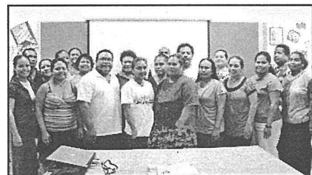
SDSU master’s degree cohort.