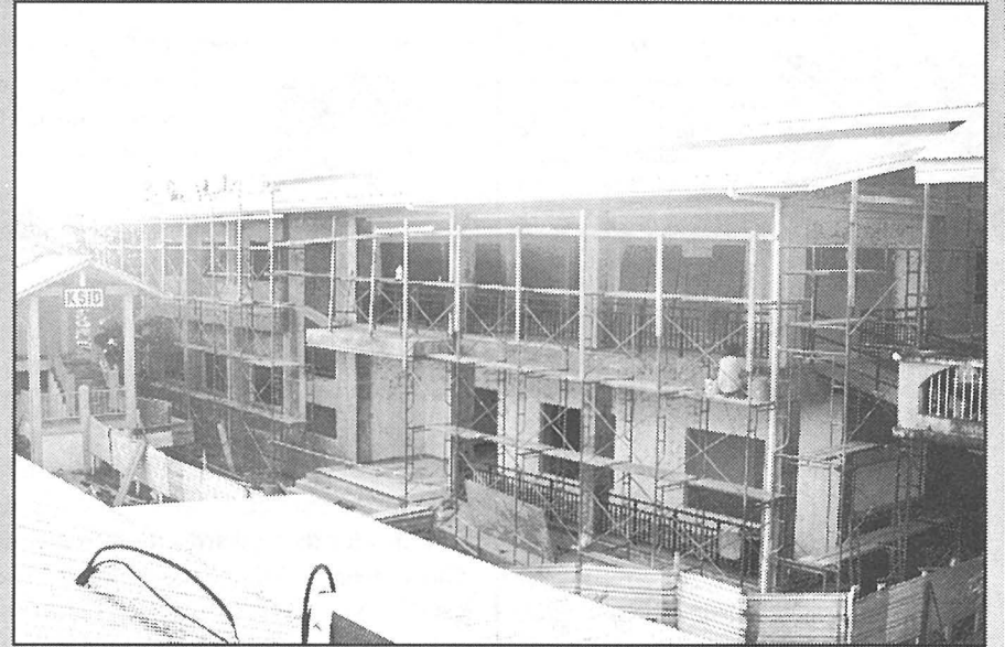
Fifty-eight (58) more days to go according to the original construction schedule of the new three-story library building. The building will house the library collections on the first two floors while the top floor will be used for faculty offices and office of the Associated Students of Palau Community College.