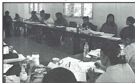
Participants from attending their fifth and final week of class, which ends today, at Baderirt Building.