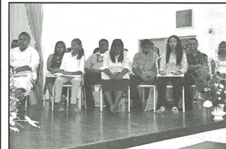
UB graduating seniors on stage at the cafeteria during their graduation banquet Wednesday night.