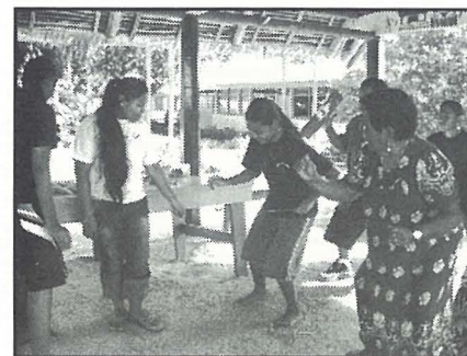
Students practicing traditional dance with their instructor (right) at Mesekiu Bai.

Koror State Government and CE office is inviting the public to witness the display of weaving, spear-making, woodcarving, and performing arts that the Summer Cultural Class students have been studying over the summer. Doors will open today at 3 :00 p.m. at Koror State Assembly Hall.