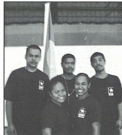
Pictured above are five of the six PCC students who enlisted in the U.S. Military.