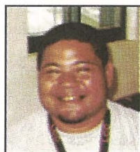
Free Soalablai Waste Water Plant, Min. of R&D