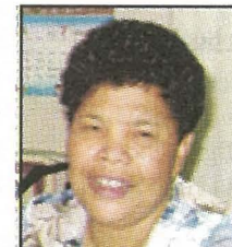
Hilaria Sungino Foreign Affairs, Min. of State