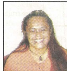
Geraldine Shmull Foreign Affairs, Min. of State