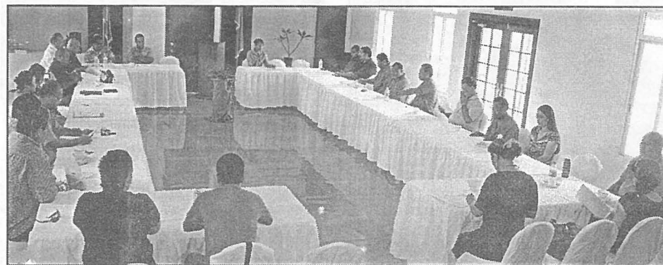
PAN & State Representatives.

For more information on how to make reservations for meetings, workshops/confer-