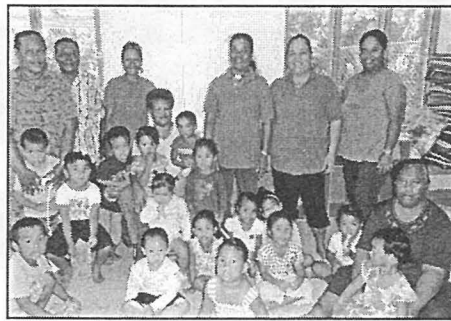
Class participants & Day Care kids & teachers.

As part of their learning experiences in early childhood program, ED192 students,