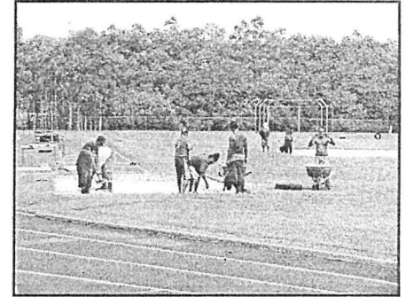
Final touches are made on the track and field facility, site of many sure-to-be exciting events.

and we hope it will reflect positively in the athletes performances and the level of competition during the games."