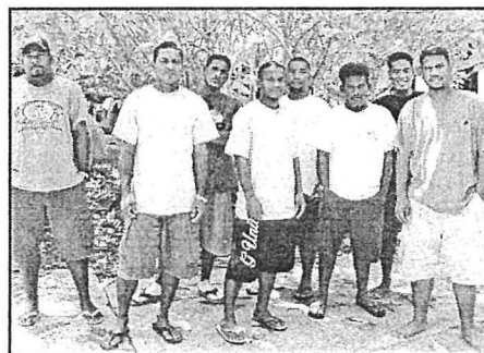
Marshallese baseball athletes who arrived on island late Tuesday night were some of the first to move into the Athletes Village. One of their goal is to beat the Palau baseball team.