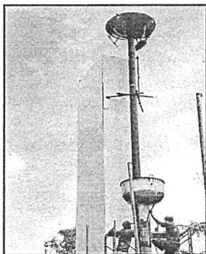
Cauldron where the flames of the 7th Micronesian Games will burn.

when asked about the readiness of Palau Community College to take on the colossal task of serving as the Athlete's