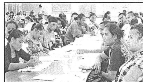
Students paying attention to the speakers.