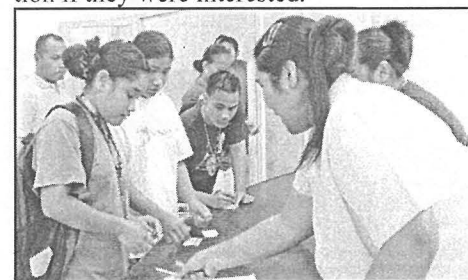
Students signing in to attend the orientation.