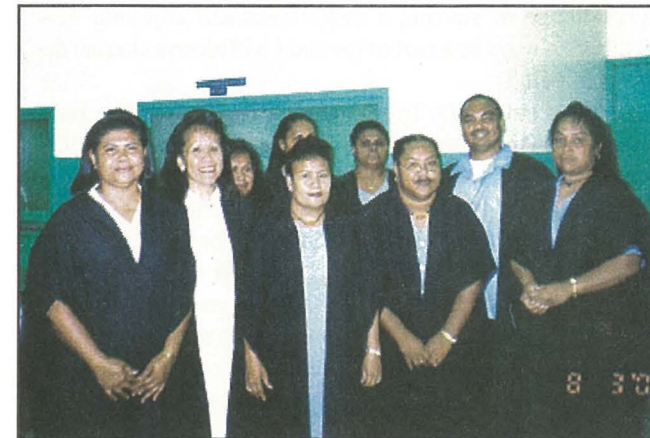
Health Care Professionals Ready to Meet Palau Health Care Needs

This Wednesday, August 4, the Fiji School of Medicine in collaboration with the Ministry of Health, the Palau Community College, and the Palau Area Health Education Center (AHEC) graduated ten nurses with an Undergraduate Certificate in Public Health (CPH) and one doctor with a Post Graduate Certificate. This is the first time ever that the Fiji School of Medicine has ever had a graduating class outside the nation of Fiji. This was made possible through its Distance and Flexible Learning program conducted here at PCC. This program incorporated an integrated curriculum on various areas of Medical sciences and public health courses for healthcare professionals in Palau. This one of a kind program is special because it gives Palau's physicians, nurses and health care professionals the opportunity to receive, learn and share valuable medical knowledge without leaving their home islands. Ten Nursing students received Undergraduate Certificates in Public Health with one receiving a Post Graduate Certificate in Public Health from the Fiji School of Medicine.