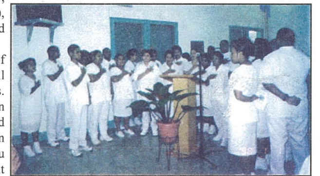
Graduates sing 'Belau Er Kid', Palau National Anthem, at their Graduation Ceremony held at the PCC Cafetorium

Even with the addition of these 29 graduates, Palau is still suffering from a shortage of nurses. Thus, any individual interested in pursuing a nursing or health related career is encouraged to enroll in PCC's Nursing Program, where you may obtain your AS degree right here at home. Call Admissions Office at 488-2471 for more information.