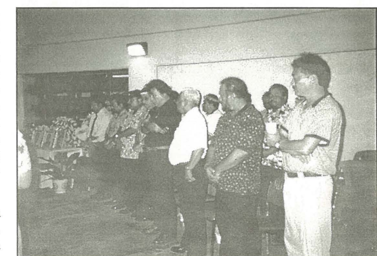
National Leaders at the Morgue, upon arrival of the bodies of three Palauan athletes who died in Pohnpei last Sunday August 4th