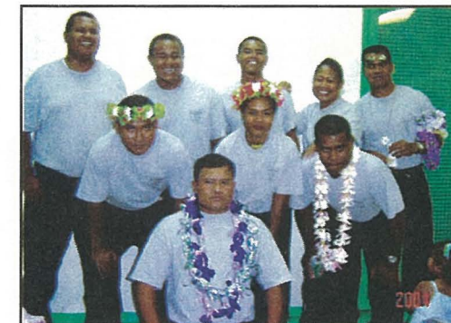
Cadets Take a Few Minutes to Pose Before Ceremony