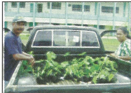
Community members who recently toured the CRE Research & Development station haul away a truck-load of taro plantings after their tour.

The Palau Community College Cooperative Research and Extension (PCC-CRE) department has been actively conducting research activities on roots crops at the Research and Development station in Ngermeskang, Ngaremlengui. Taro, an important staple food in Palau and other Pacific countries has been the focus of research attention. In the Outreach Programs conducted by the PCC-CRE in various states, information on results of researches on various root crops are being disseminated aimed at increasing productivity and food security of local food in Palau. One of the major activities at the R & D station is the rapid mass propagation of planting materials of taro both through tissue culture and field propagation.