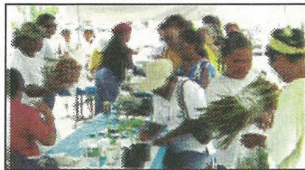
PCC-CRE's booth at the Olechotel Belau Fair (OBF) this summer attracted over 100 taro farmers looking for planting materials. The booth gave away over 2500 planting materials of the Ngesuas variety.

For more information, please call PCC-CRE at 488-2746.