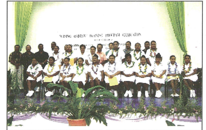
The newly graduated Nursing Assistants pose with the Honorable President Tommy Remengesau Jr., and other honored guests.