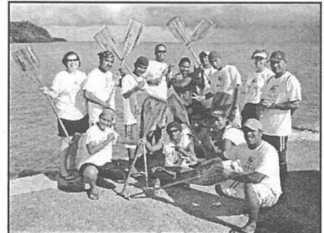
PCC Canoe Club paddlers after winning a local race earlier this summer.

Paddlers will meet at Rip Tide in Malakal early Saturday and Sunday morning for training as well as finalize schedule for the remaining weeks before the competition. Interested students are asked to come to Rip Tide this weekend.