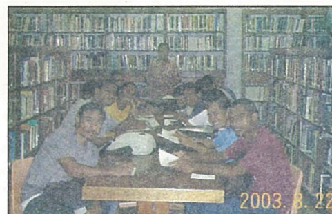
New students with a library staff during orientation.

The White House Historical Association - Celebrate President's Day by visiting the most well known house in America, the White House. This site, maintained by the White House Historical Association, is an informative resource for facts about America's house and the people that have lived, worked and visited there. The site features a virtual White House tour; the objects and artwork presidents have left behind, biographies of American Presidents and First Ladies, and timelines illustrating how developments in architecture and technology have influenced the White House. The site's Learning Center includes lesson plans for teachers and interactive activities for students related to a variety of curriculum areas. Suitable for grades K - 12.