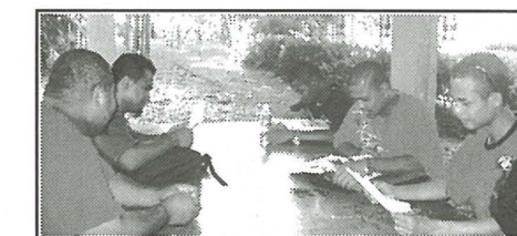
Students utilizing their break time to do their homework.

For more information on the many wonderful programs PCC offers, please call 488-2470/2471 or visit our website at www.palau.edu .