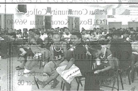
Dorm residents gather to cheer the Bethania Alumni perform a special number at the cafeteria on Tuesday.

at the Belau National Hospital, Palau High School, as well as the campus Health Resource Center. She also encouraged them to practice safe sex and abstinence until the time they are mentally, physically, and financially ready to deal with the consequences of unsafe sex (sexually transmitted infections, pregnancy, etc.). Afterwards, the students enjoyed a special number from the Bethania Alumni while enjoying delicious snacks prepared by the cafeteria staff. "Tuesday Night" program is held every last Tuesday of the month for dorm residents to showcase valuable tips about living healthy lives, being good students, and being good members of the community.