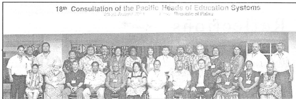
Participants of the 18th PHES with President Toribiong (5th from right).