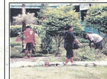
In preparation for the start of the Police Academy on campus, students were busy cleaning the lower campus earlier this week.