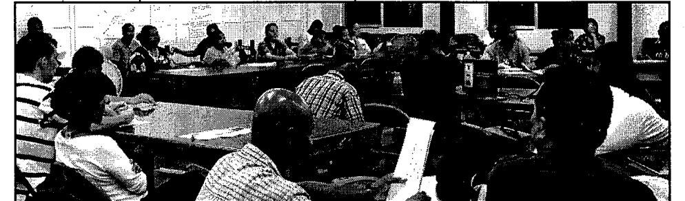
Parents of Mindszenty High School students attending the training.

The training for Melkeok Elementary School PTA was held on August 06, 2012. On August 20 - 23, 2012, the ETS and CACG staffs conducted the training at Mindszenty High School with parents from different grade levels. The Airai Elementary School parent training took place on August 27, 2012. The training gives parents ideas on how to college orient in their homes and how to seek extra help to help their children become college bound. PCC ETS Program extends its appreciation to the CACG staff for their endless support and collaboration in conducting these valuable trainings to parents