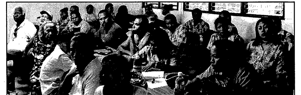
Parents of Melekeok Elementary School students attending the training.