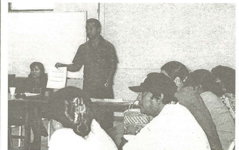
PCC Staff attend meeting with Pension Plan staff at the College's CE Training Room