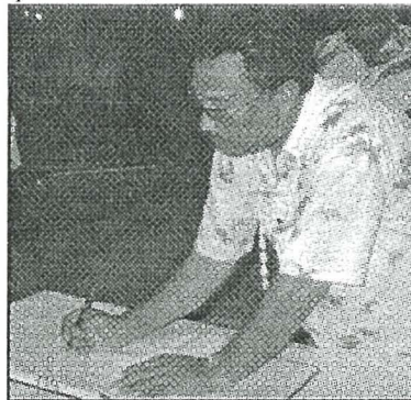
ROP President Tommy Remengesau Jr. signs a guest book to conclude the memorial service marking the 5th anniversary of 9-11.

Palau has and remains a staunch supporter of the United States since it declared war on terrorism after the September 11, 2001 attacks.