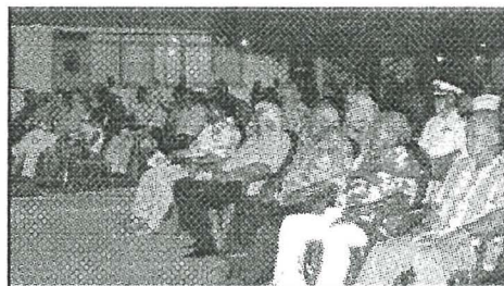
Guests at the memorial service.