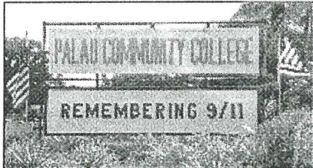
PCC joins ROP in remembering 9-11.

We all remember a most tragic event (9-11 terrorist attacks) that occurred five years ago in the United States which claimed thousands of innocent lives. Palau Community College marked the 5th anniversary of the 9-11 attacks by organizing a national memorial ceremony to remember the numerous lives of victims that were tragically lost on that ill-fated day.