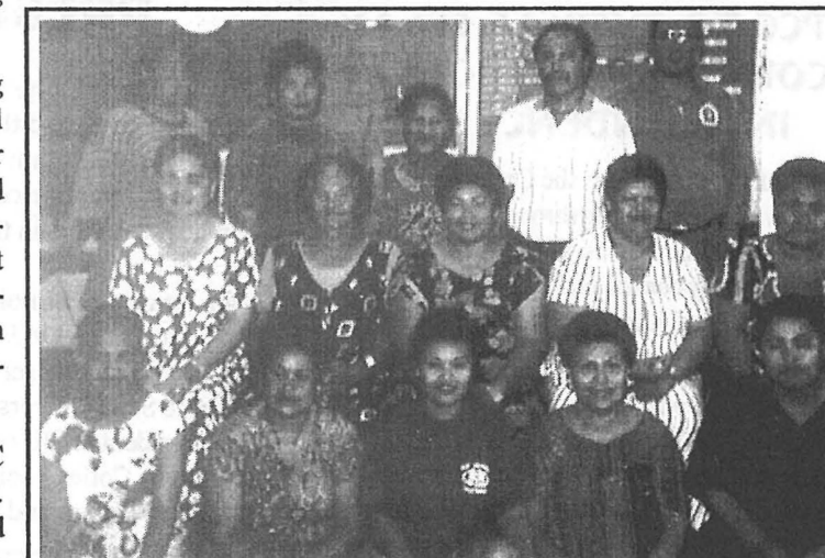
Aimeliik Principal, teachers, Teachers' Aide, Cooks, Librarian, and State Officials become newest members of the PCC Endowment Club