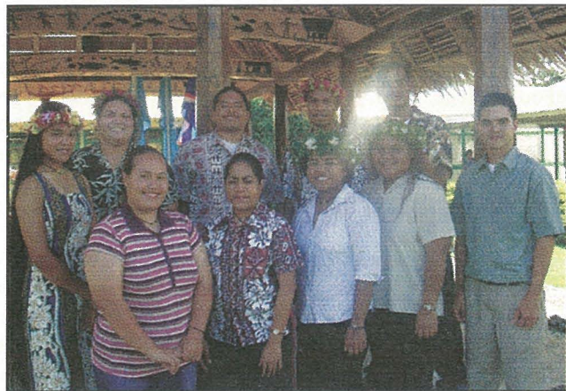
Project Beacon participants who are also members of the PCC Student Body Association..

Congratulations and Best of Luck to the following program participants for taking on the additional responsibilities of representing fellow students this school year. We are proud of you, and confident that you will make a difference in your tenure of office. These special students are: